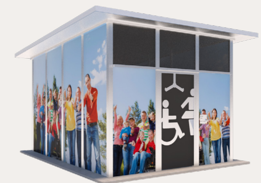
Premium Finish – Graphic Aluminium composite panels with vinyl graphic and anti-graffiti coating