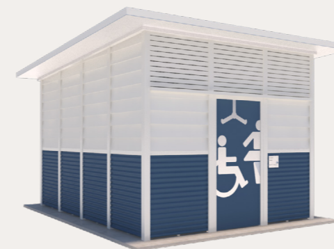
Standard Finish Colorbond (lower) and aluminium cladding (upper)