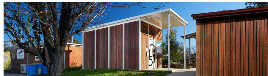
Changing Places 2

Changing Places provide a much needed amenity to adults living with severe disabilities, offering full facilities for changing, showering and toilet needs.