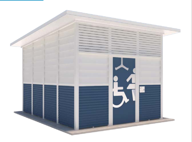
Standard Finish Colorbond (lower) and aluminium cladding (upper)

Stakeholders will have the peace of mind that they are investing in an asset that is tried and proven all around Australia.