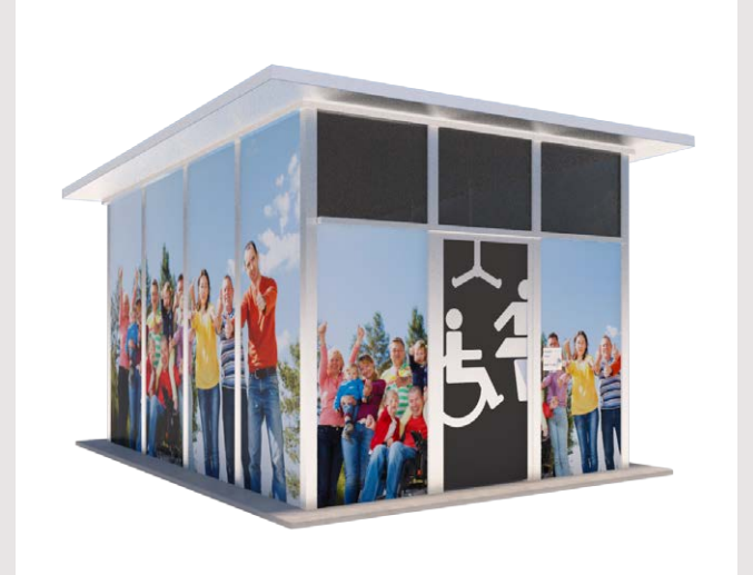
Premium Finish – Graphic Aluminium composite panels with vinyl graphic and anti-graffiti coating