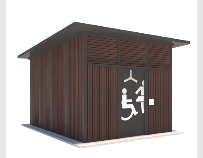
Premium Finish – WPC Wood Plastic Composite battens